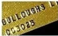
Golden Emboss NO.