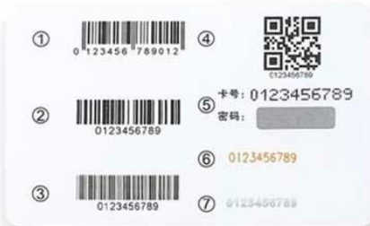
C. ① EAN 13 Barcode ② Code 128 ③ Code 39 ④ QR Code ⑤ Card NO. & PIN Code ⑥ Laser Code ⑦ Flat Code