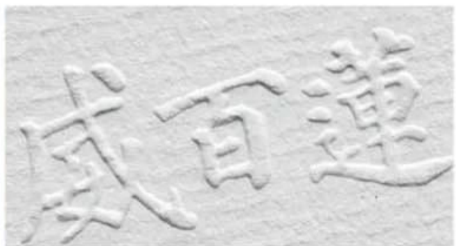
Concave and convex