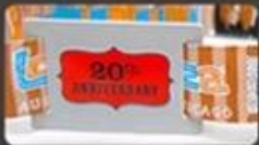
4C custom LOGO printing