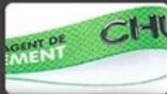
Heat Transfer Printing