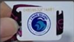
Laser Serial/UID Numbering