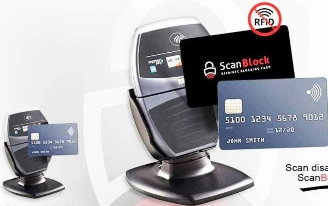
RFID Credit/Debit card scanned