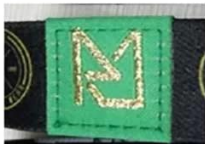
Gold woven logo