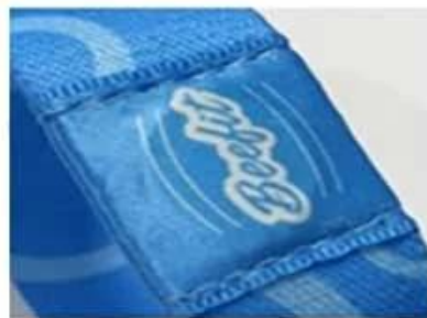
Thermal print logo