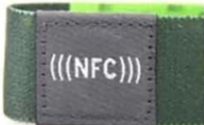
Four sides stitch