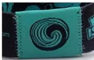
Z sides stitch