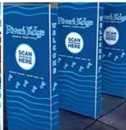
Exhibition & Conference