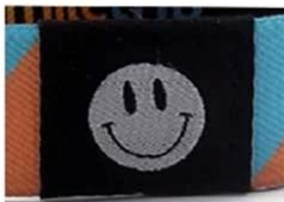
Panton woven logo