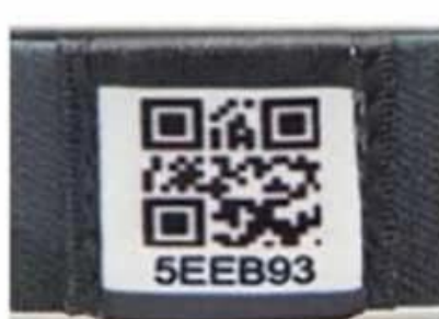
Unique QR code and number