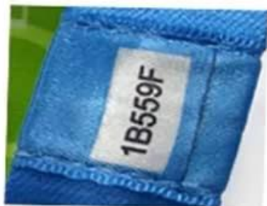
Unique serial number