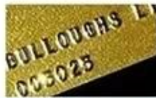
Golden Emboss NO.