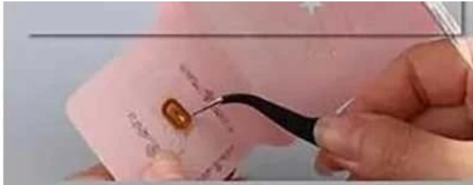
Step1 Gently take out the NFC Nail Sticker by tweezer. Take out the wrap in the back size and keep it as precaution.