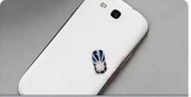
Step10 Approach NFC device,the led light up and blink.