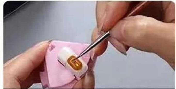
Step4 Use nail art pen to smooth the top.