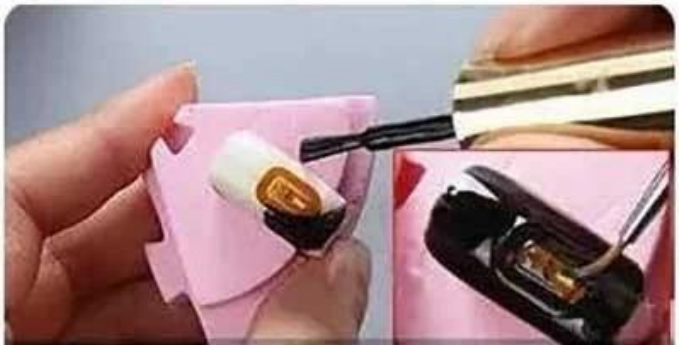
Step6 Apply color gel and repeat lamp curing.