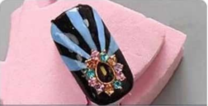
Step9 It's finish,it's easy.