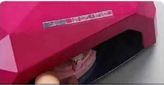
Step5 Use a UV / LED lamp to cure the gel.