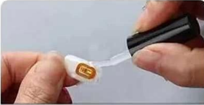
Step3 Apply base coat, but keep the gel out of the led.