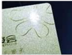
golden Hot Stamping