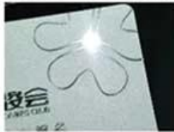
Silver Hot Stamping