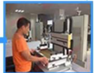
5.Film fabrication for printing