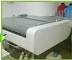
2.Film fabrication for printing