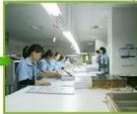
5.Printing sheets match up