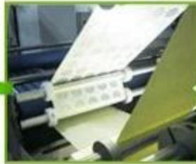
6.Lamination & formation