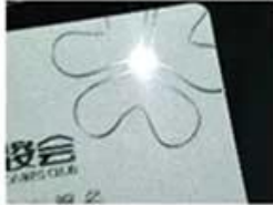
Silver Hot Stamping