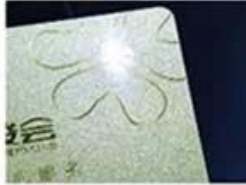
golden Hot Stamping