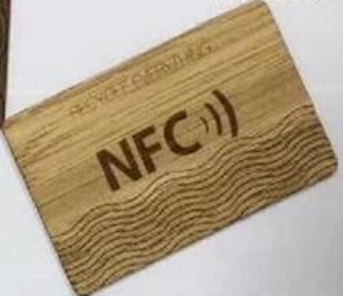
2 bamboo wood