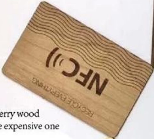
6 cherry wood the expensive one