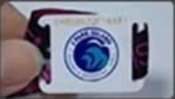
Laser Serial/UID Numbering