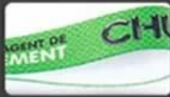
Heat Transfer Printing