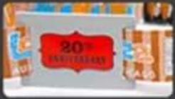
4C custom LOGO printing