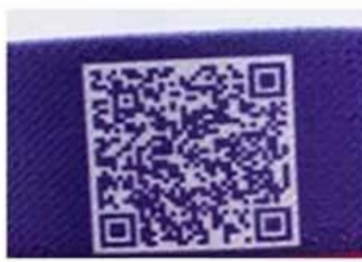
Unique QR code on band