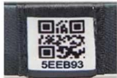
Unique QR code and number