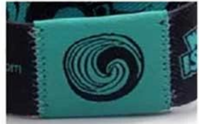
Z sides stitch