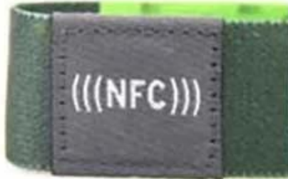
Four sides stitch