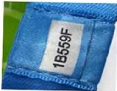
Unique serial number