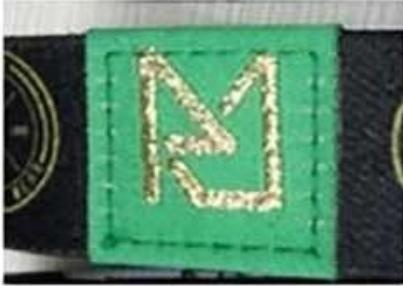
Gold woven logo