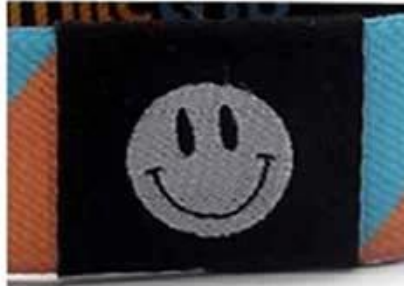
Panton woven logo