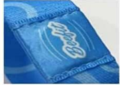
Thermal print logo