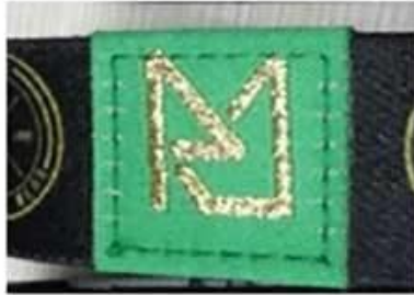
Gold woven logo