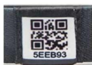
Unique QR code and number

If you want to know more or want to custom Elastic RFID wristband products, please feel free to contact us: info@nfctagfactory.com