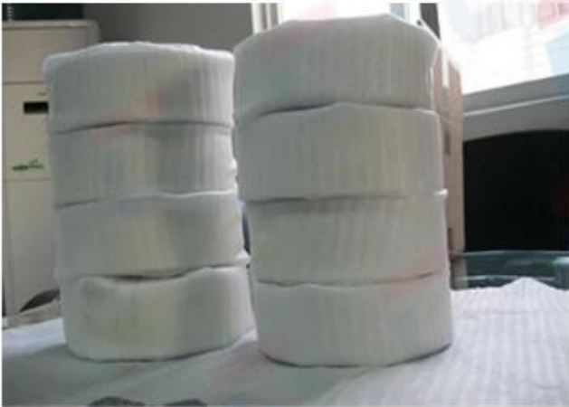
Protect with Bubble Pack