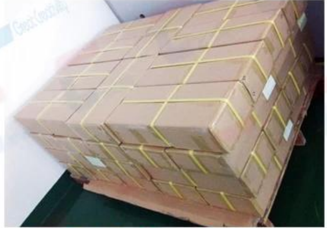
Outside Carton Package