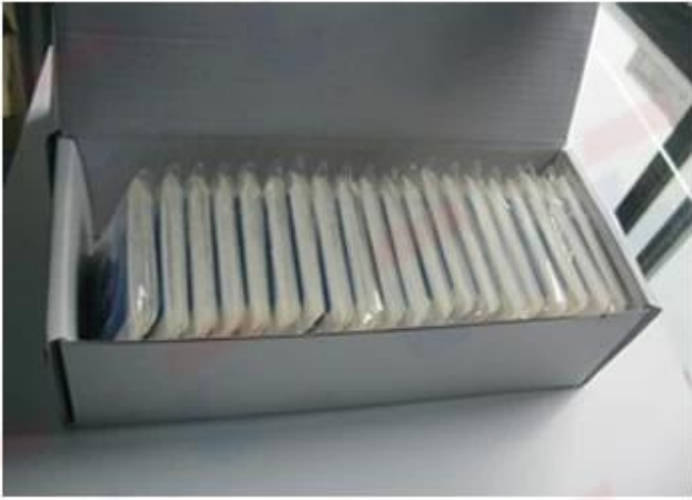
Packed By Pieces with OPP Bags