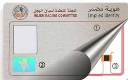
H、①Pearlescent Color ②Anti-fake label ③RFID Chip