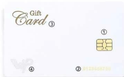
F、①4442 Chip ②Gold Flat Code ③Gold Silk Screening ④Silver Silk Screening