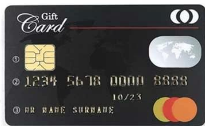
E、①4428 Chip ②Large Convex Code ③Small Convex Code