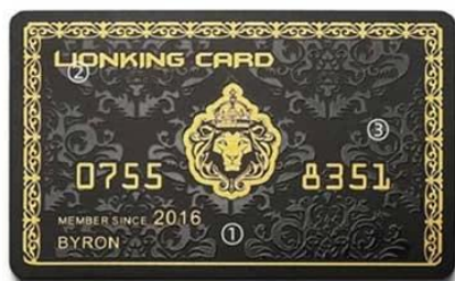
K、①Matt finish ②Gold drawbench ③UV vanish