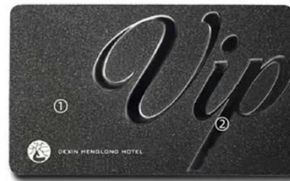
L、①Frosted finish ②Metal Label