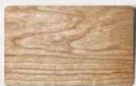
Red cherry wood