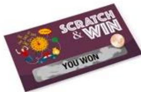
【Scratch off panel】