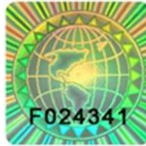
【 Hologram 】