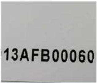
【 DOD Numbering 】