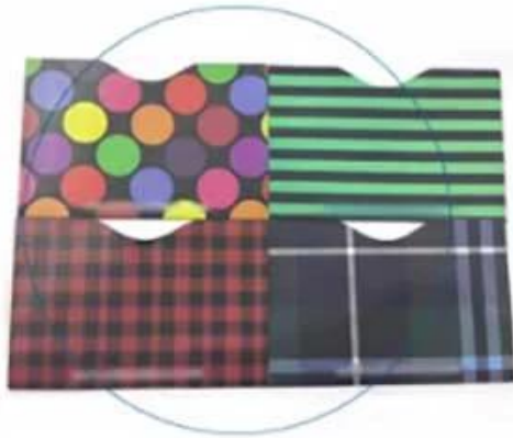
ALU FOIL PAPER SLEEVE