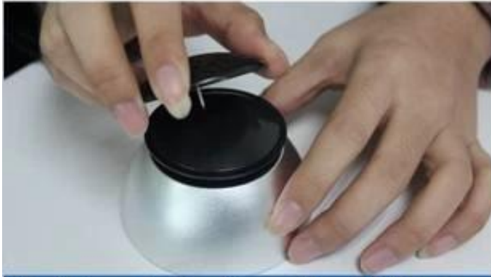
No.1 Open the hard tag with golf detacher