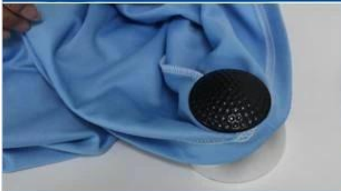
No.4 Taked on the golf detacher