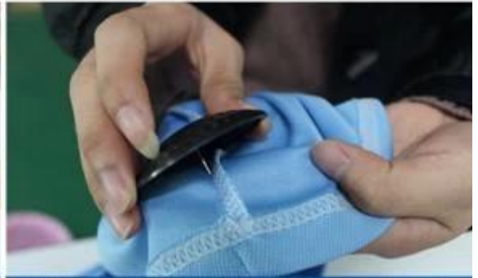
No.2 Insert the pin into the seam of clothes