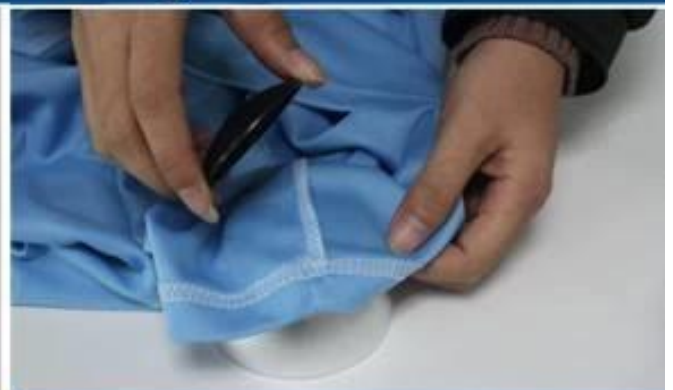
No.5 Remove the pin