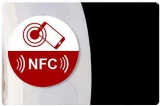
White label printing Coated paper + printing + antenna + chip + adhesive layer