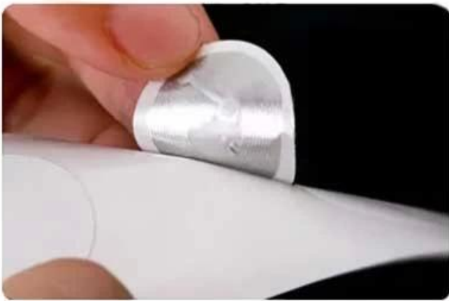
White label Coated paper + antenna+chip +adhesive layer