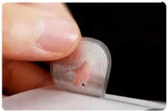
Wet label Antenna + Chip + Adhesive Layer