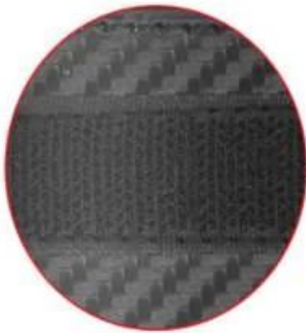
HIGH QUALITY VELCRO