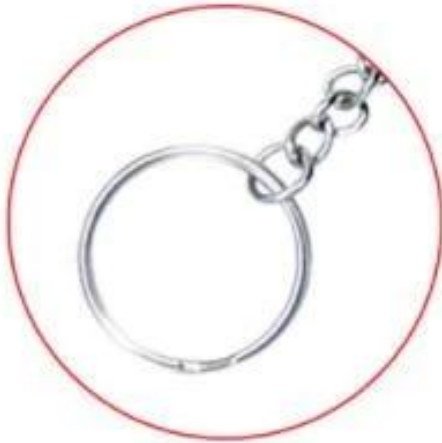
FIRMLY METAL KEYCHAIN