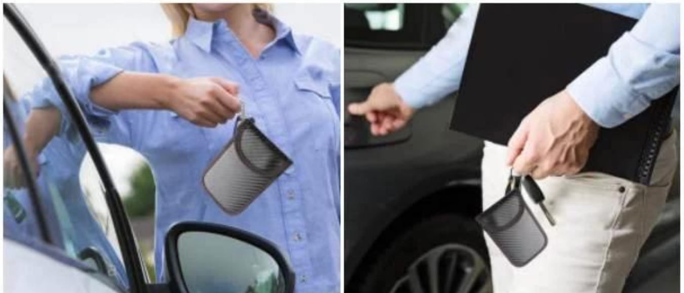
RFID Signal Blocking Bag Detailed Image: