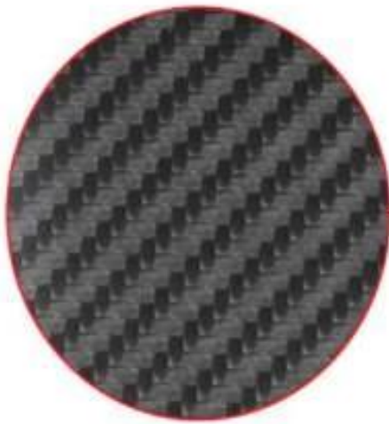
CARBON FIBER TEXTURE