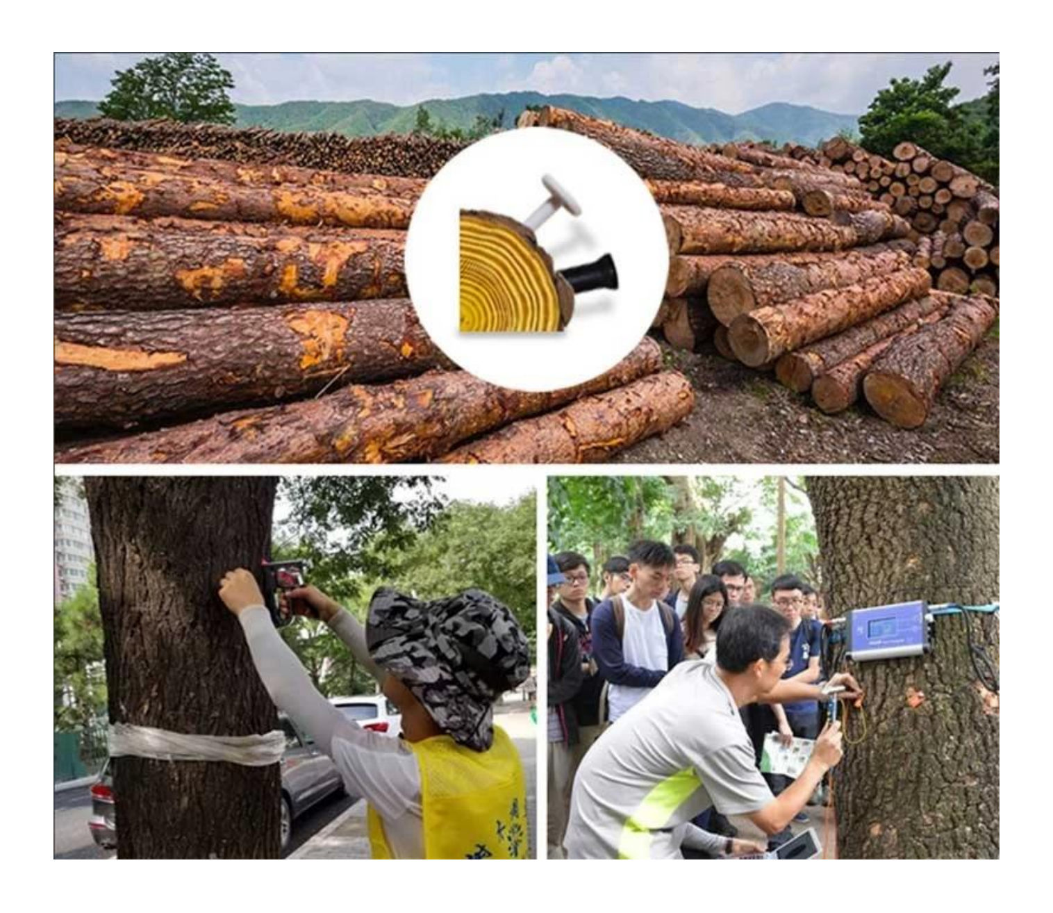
ABS Tree Nail RFID Tag Packing Details: