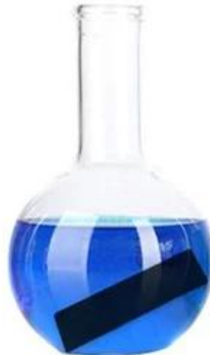
Alkali resistant laundry detergent