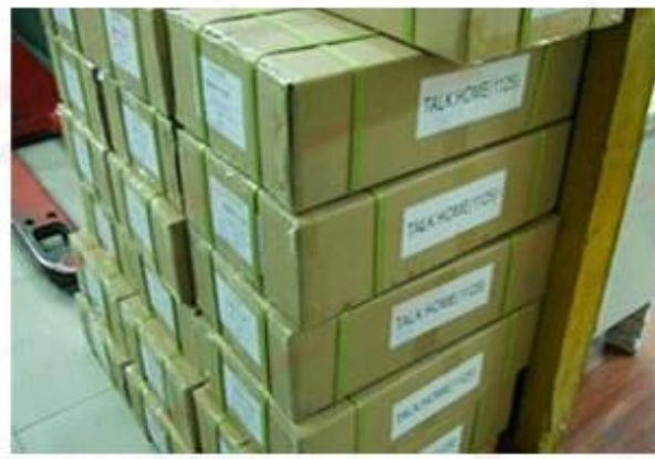
Outside Carton Package