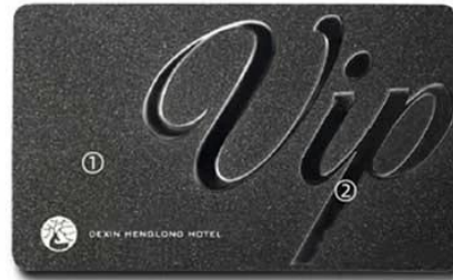
L. ① Frosted finish ② Metal Label