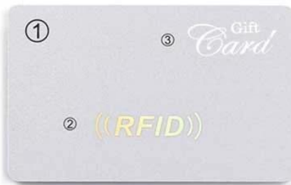
B. ① Silver Color ② Laser Silver Stamping ③ Silver hot Stamping