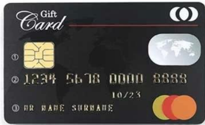
E. ① 4428 Chip ② Large Convex Code ③ Small Convex Code