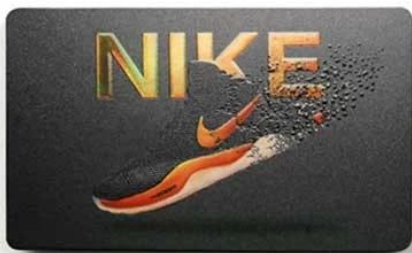
I. Embossed printing