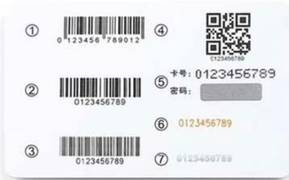
C. ① EAN 13 Barcode ② Code 128 ③ Code 39 ④ QR Code ⑤ Card NO. & PIN Code ⑥ Laser Code ⑦ Flat Code