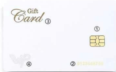
F. ① 4442 Chip ② Gold Flat Code ③ Gold Silk Screening ④ Silver Silk Screening