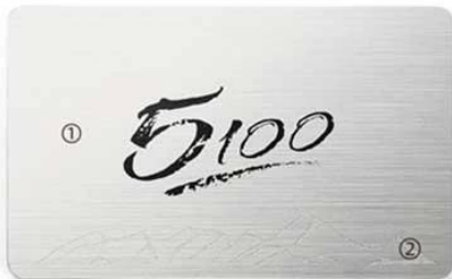
G. ① Silver drawbench ② Frosted UV