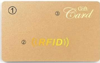
A. ① Gold Color ② Laser Gold Stamping ③ Gold hot Stamping