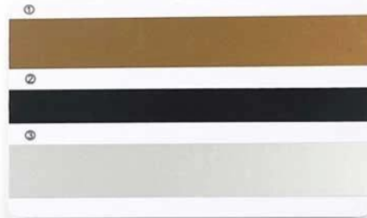
D. ① Gold Magnetic Stripe ② Black narrow Magnetic Stripe ③ Silver Magnetic Stripe