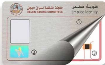
H. ① Pearlescent Color ② Anti-fake label ③ RFID Chip