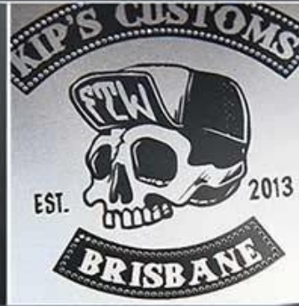
Spot color Printing