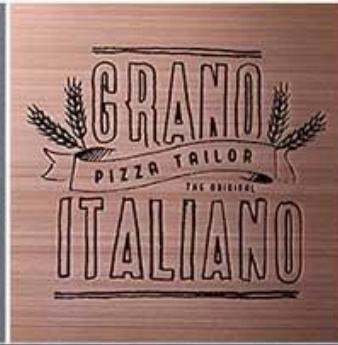
Etch with color infilling