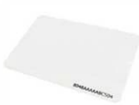
White PVC Card