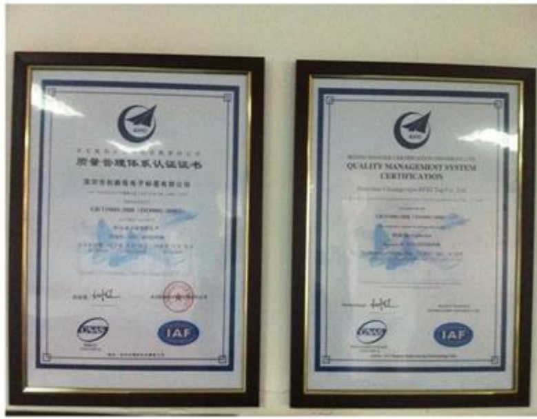
ISO9001 - 2008 Certificate