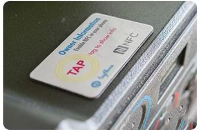
NFC business card