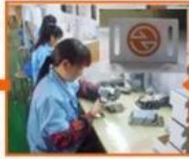
6. Testing & QC