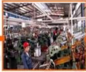
7. Fabric strip producing