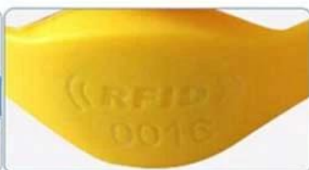
Laser UID number