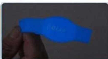
Glow in dark