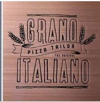
Etch with color infilling