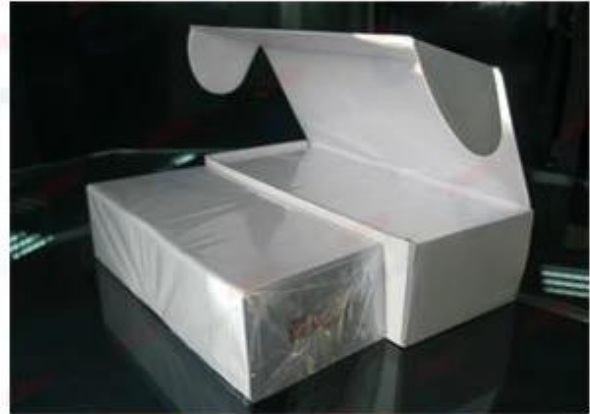
250/200 pcs Cards with Clear Paper