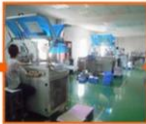
7.Punching & Diecutting