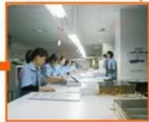
5.Print sheets matching