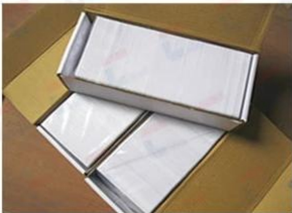
Inner Box Package