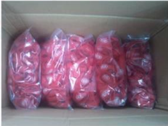
Package for Silicone Wristbands