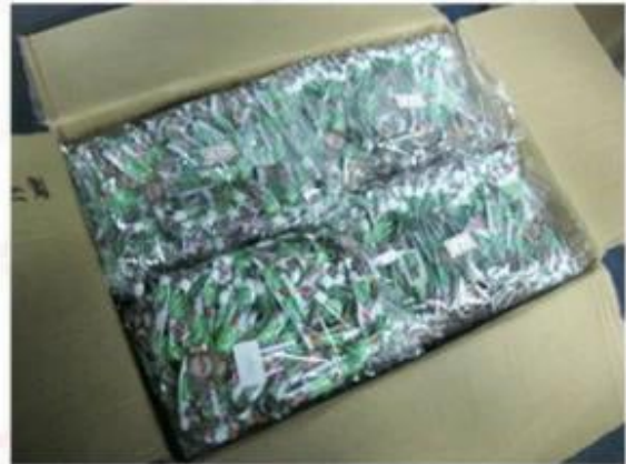
Package for Woven Wristbands