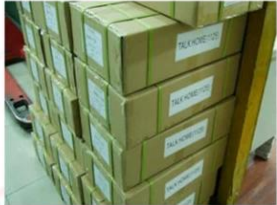
Outside Carton Package