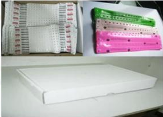
Package for Soft PVC/ Paper Wristbands