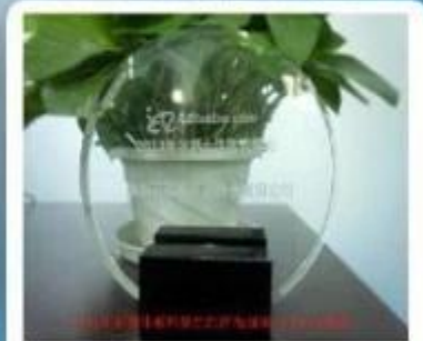
Outstanding and Honorable E-Businessman Award by Alibaba in 2011

Shenzhen Chuangxinjia smart card co.,Ltd offers RFID wristbands in a variety of materials, such as silicone, woven (cloth), and plastic, paper etc. We can customize them to include your logo and we have a various range of color offerings. We have RFID wristbands for point of sale, keyless hotel rooms, access control & security, counterfeit prevention, customer loyalty programs, and waterproof environments. Our goal is to help design a securely-sealed wristband that can reliably store and transfer data.