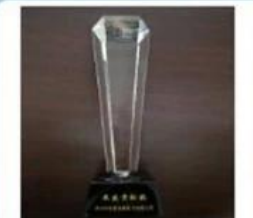
Outstanding and Honorable EBusinessman Award by Alibaba in 2010