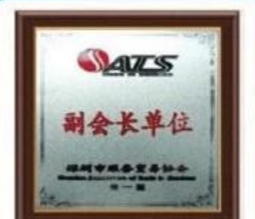
Vice President Company of Shenzhen Association of Trading in Services