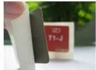
8. Anti-metal Stickers