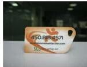
7. NFC PVC Tags