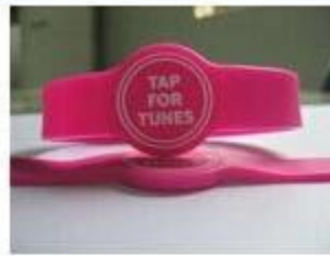
3.Silicone Wristbands (Adjustable Type )