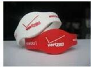
4.Silicone Wristbands (Full Sealed Type)