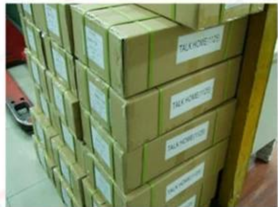
Outside Carton Package

Production process of Silicone RFID Wristband: