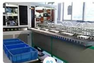
03 Automatic die-cut machine