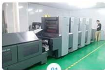
01 Heidelberg 4 color printer