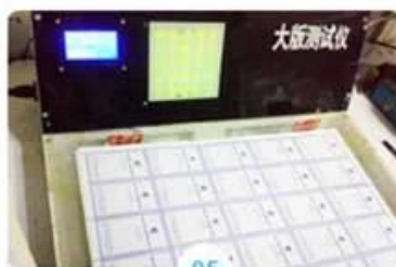
05 Pick-up whole sheet