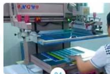
04 Silkscreen printing signature