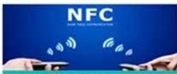
Data Exchange P2P