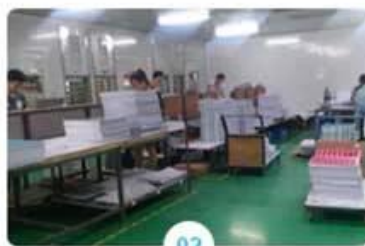
02 Laminating on machine