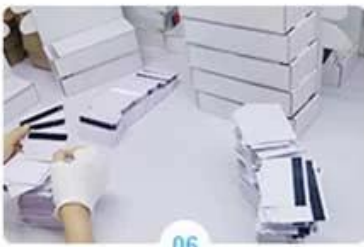
06 Pick-up cards