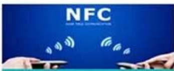
Data Exchange P2P