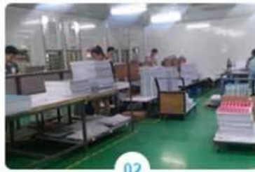
02 Laminating on machine