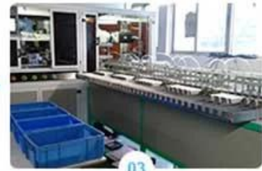
03 Automatic die-cut machine