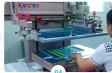
04 Silkscreen printing signature