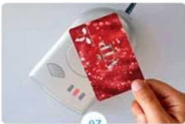
07 Pick-up cards