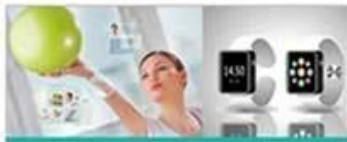
Medical & Healthcare Devices