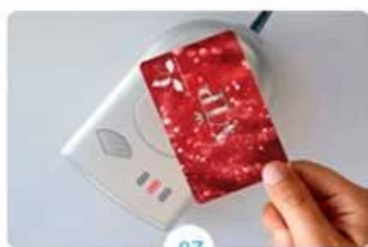
07 Pick-up cards