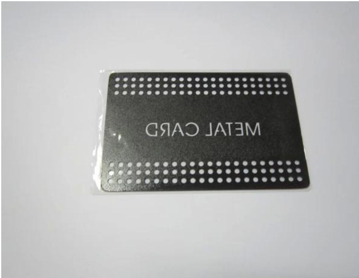
Reference Table of Customize Black Metal Card