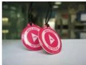
2.NFC Epoxy Tags