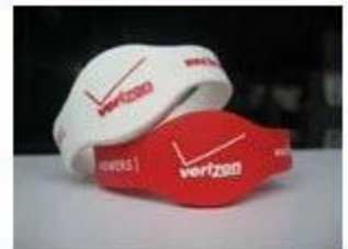
4.Silicone Wristbands (Full Sealed Type)