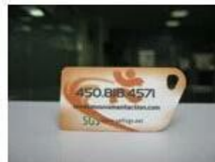
7. NFC PVC Tags