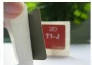
8. Anti-metal Stickers