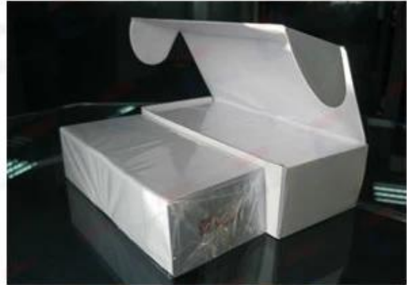
250/200 pcs Cards with Clear Paper