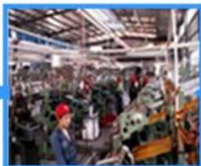
7.Fabric strip producing