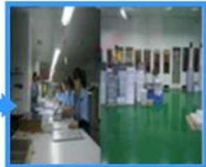
4.Matching & Compounding