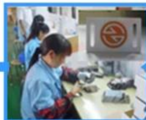
6.Testing & QC