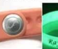
laser LOGO on lock