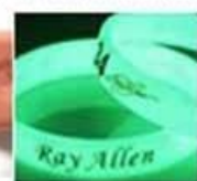
glow in dark