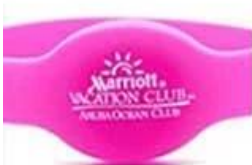
1 C silk screen printing