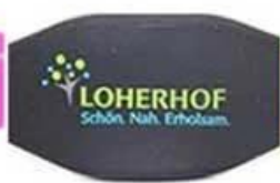
3 C silk screen printing