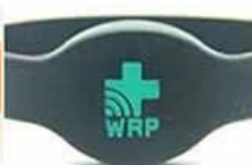
laser engraved with color