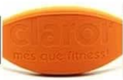
laser engraved no color