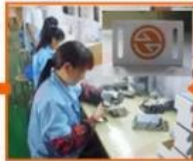
6. Testing & QC