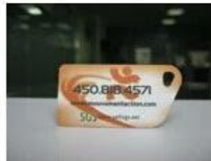
7. NFC PVC Tags