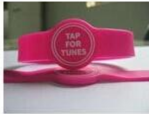
3.Silicone Wristbands (Adjustable Type )