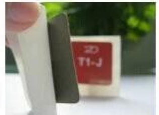
8. Anti-metal Stickers