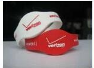
4.Silicone Wristbands (Full Sealed Type)