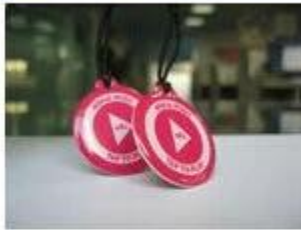
2.NFC Epoxy Tags