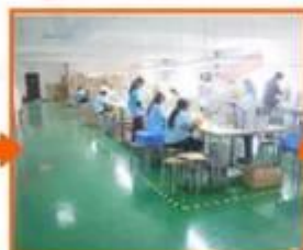
10. Final QC