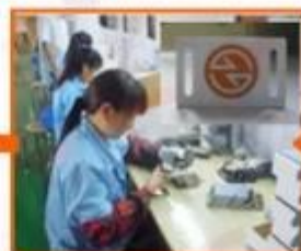
6. Testing & QC