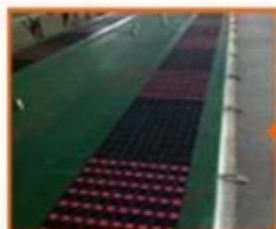
8. Strip printing