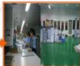
4. Matching & Compound