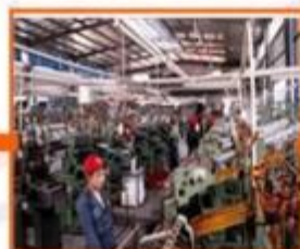
7. Fabric strip producing