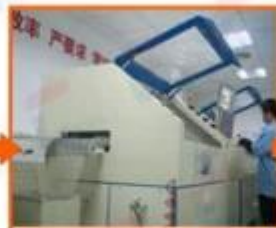
2. Chip bonding