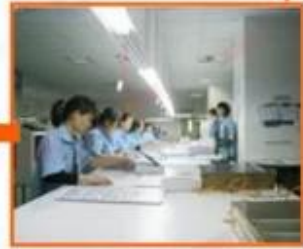
5.Print sheets matching