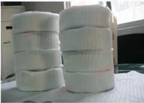
Protect with Bubble Pack