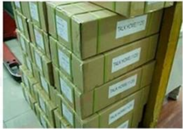
Outside Carton Package