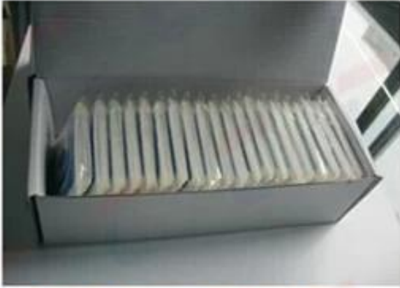
Packed By Pieces with OPP Bags