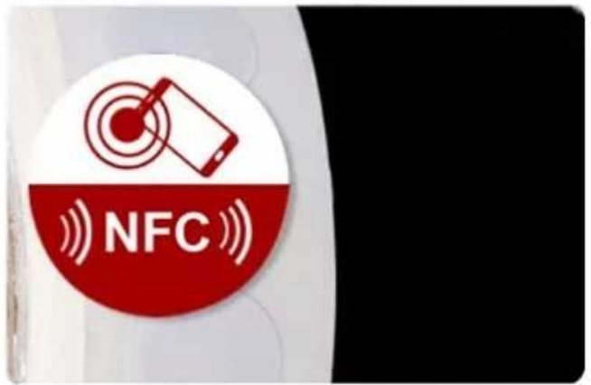
White label printing Coated paper + printing + antenna + chip + adhesive layer