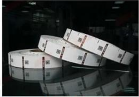
Packed By Roll